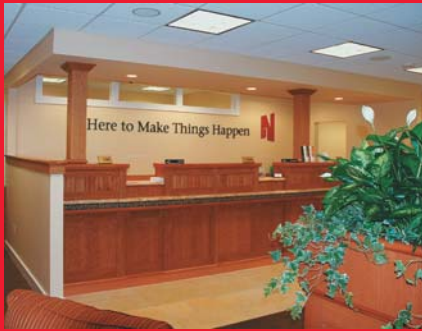
The teller line features granite tops, embedded tiling and cherry millwork.