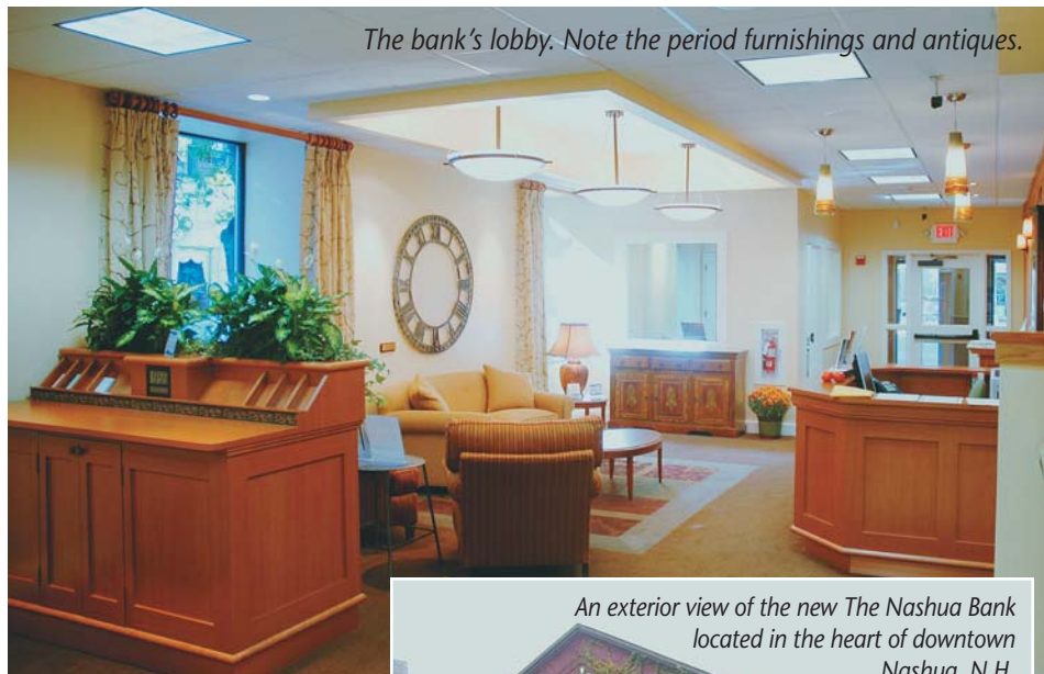
The bank's lobby. Note the period furnishings and antiques.

5 Congress Street • P.O. Box 443 Nashua, NH 03061-0443 TEL (603) 882-7498 FAX (603) 595-8688